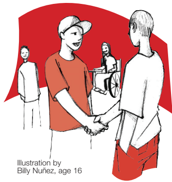
Illustration by Billy Nuñez, age 16